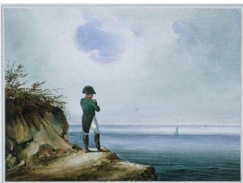
Napoléon à Sainte-Hélène by Francois-Joseph Sandmann

In the decades before 1816, Napoleonic France had fought a series of wars to control Europe, pitting the commercial and military power of France against that of Great Britain. To try to strangle Britain economically, Napoleon had imposed the European System, banning trade with Britain. The British responded in kind. In the midst of such tensions, American ships sought neutrality and trade. Impressment and economic restrictions imposed by Great Britain convinced Monroe that war was the best response. As Secretary of State during the War of 1812, Monroe helped guide the nation to enhanced international prestige, if not clear victory against Great Britain.