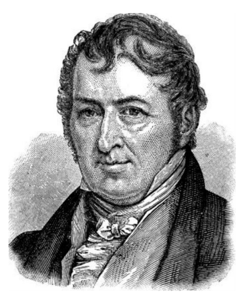
Eli Whitney, inventor of the revolutionary cotton gin

While the defining transportational innovation of American industrialization, the railroad, would not occur until later in the nineteenth century, 1816 was still a year in a time of transportational development, dubbed by some as the Turnpike Era (between 1790 and 1820) because of the proliferation of roads all over the country. In 1816, the famous Cumberland Road was under construction. By 1816, there were steamboats chugging up and down the Mississippi and Ohio rivers, thanks to the vindication of steamboat technology by Robert Fulton, a Pennsylvania native who experimented with steamboat designs while living in France in the 1790s. Fulton's prototype steamboat, the Clermont , proved its metal in 1807 when it navigated the Hudson River from New York City to Albany.