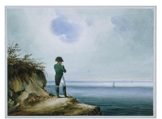
Napoléon à Sainte-Hélène by Francois-Joseph Sandmann

In the decades before 1816, Napoleonic France had fought a series of wars to control Europe, pitting the commercial and military power of France against that of Great Britain. To try to strangle Britain economically, Napoleon had imposed the European System, banning trade with Britain. The British responded in kind. In the midst of such tensions, American ships sought neutrality and trade. Impressment and economic restrictions imposed by Great Britain convinced Monroe that war was the best response. As Secretary of State during the War of 1812, Monroe helped guide the nation to enhanced international prestige, if not clear victory against Great Britain.